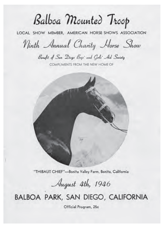
A program of August 4, 1946 announcing the Ninth Annual Charity Horse Show at Balboa Park.

Many of the nurses stationed at Balboa Naval Hospital also became regular