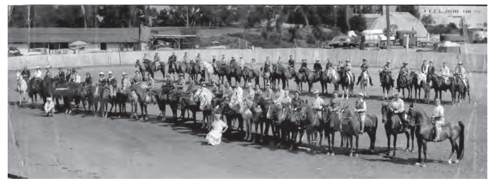
Sunday morning breakfast ride with the Silvergate Riding Club. The clubhouse at the back of the photo served pancakes, eggs, and punch.

ride along a dirt road. Another trail led northeast, toward Morley Field via Florida Canyon. The bridle paths meandered through rocky hillsides of sagebrush, cacti, and other flora and fauna. The nearby Balboa Golf Course was strictly prohibited to riders. Mischievous children got in big trouble if they ventured to take their horses on the beautiful greens.