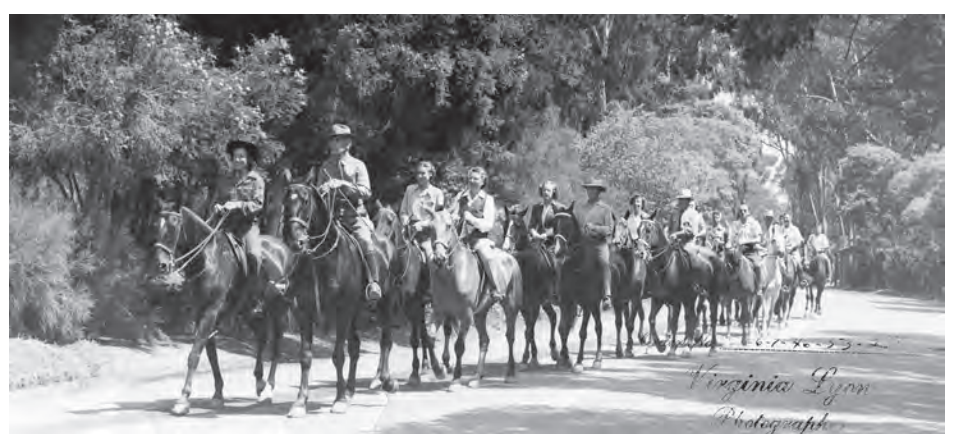
Groups of riders often traveled along the horse trails on the west side of Balboa Park.

During the 1940s, breakfast rides at the Balboa Stables were a place for socializing. This was a regular event that was popular with family members of