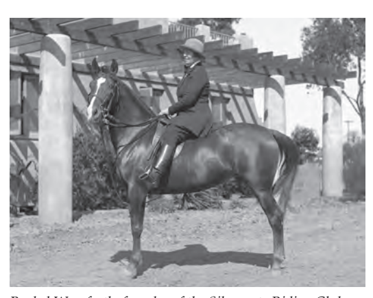
Rachel Wegeforth, founder of the Silvergate Riding Club, on horseback, September 14, 1925.

Until 1960, when a freeway interchange altered the southwest corner of Balboa Park, horse stables and 17 miles of bridle paths attracted equestrian enthusiasts,